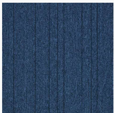
First Straightline 504