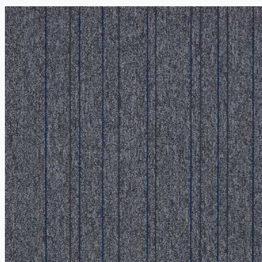
First Straightline 965