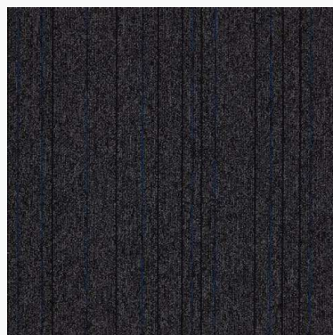
First Straightline 995