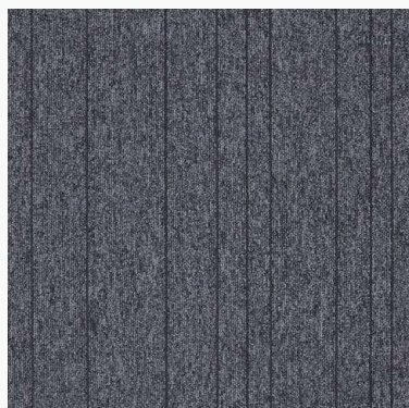
First Straightline 961